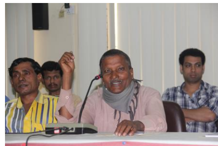
Voice of Construction Worker in consultation on Recruitment of Domestic Construction Workers