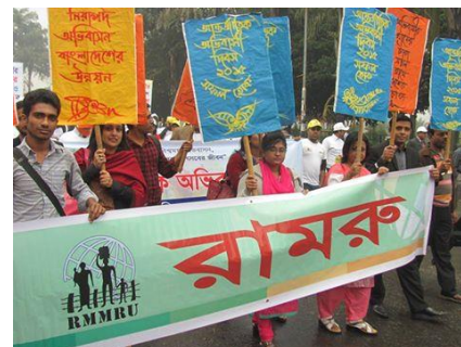
Rally on International Migrants' Day, 2015

After one year of the G2G Agreement with Malaysia, RMMRU noted that hardly any worker could migrate to the country. Since then RMMRU engaged itself in a sustained campaign asking the government for evaluation of the arrangement. Due to sensitivity of the issue no other private sector or civil society organization joined the campaign. In June 2015 the GoB officially acknowledged the failure of the G2G and revised the policy.