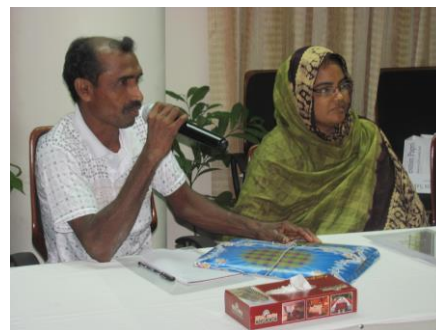
Voice of migrant family in Dialogue on Wage Earners’ Welfare Fund