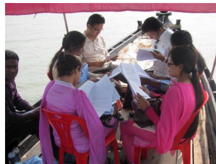
Members of RMMRU-DECCMA research team in Satkhira

Construction is defined as a formal sector job under government regulation. However, informality prevails in every aspect of labour recruitment and management in this sector. Informality allows the employers and intermediaries to