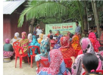
Courtyard Meeting in Miressharai

Information is not available on migrants who return every year after finishing their work contracts. RMMRU experimented and developed a method of recording data of returnee migrants. It conducted a near-census in its project areas through the MRPCs. The result shows that 27 per cent of the total migrant households are returnee households. This data-base has high potential for providing support for reintegration, linking jobs to the returnees and conducting research. RMMRU has uploaded profile of the returnee migrants in a web portal ( www.returnemigrant.info ). The portal was launched on 10 October 2015. This system of record keeping can be replicated nation-wide by the government.